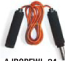
AJROPEWL-24 Leather - Weighted