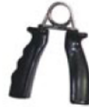
AHGRIPP-24 Plastic Handle