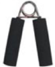
AHGRIPF-24 Foam Handle